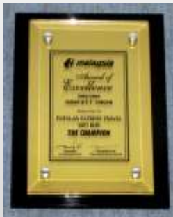
Malaysia Airlines "The Champion" 2003 / 2004