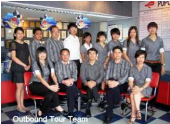
Outbound Tour Team