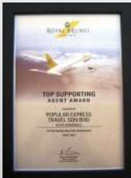
Brunei Airlines "Top Supporting Agent" 2012/2013