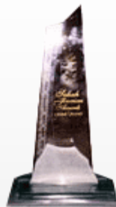
Sabah Tourism Board "Best Sabah Tour Operator" 2001/2002