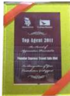
Dragon Air & Cathay Pacific "Top Agent" 2011