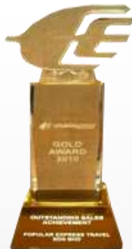
Malaysia Airlines "Gold Award" 2010

Malaysia Airlines, Royal Brunei Airlines & Silk Air