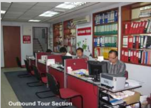
Outbound Tour Section