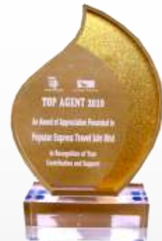
Dragon Air & Cathay Pacific "Top Agent" 2010