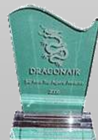
Dragon Air "SE Asia Top Agent" 2006"