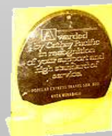
Cathay Pacific "High Standard Service" 2007