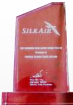
Silk Air "Top Passenger Sales Agency" 2012/2013