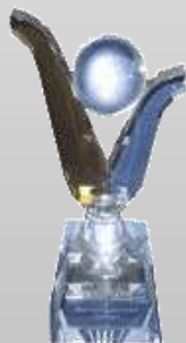
Hong Thai Travel (Hong Kong) "Best Land Agent" 2006/2007