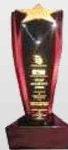
Dragon Air & Cathay Pacific "Top Agent" 2008