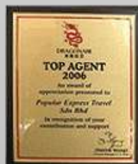
Dragon Air "Top Agent " 2006