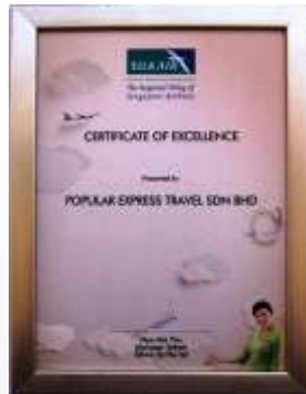
Silk Air "Certificate of Excellence" 2012/2013