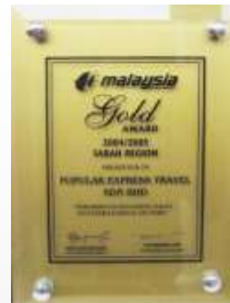
Malaysia Airlines "Gold Award" 2004 / 2005