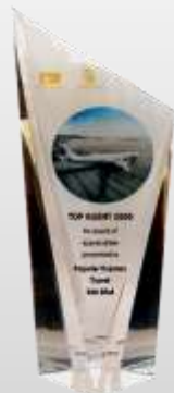
Dragon Air & Cathay Pacific Top Agent 2009