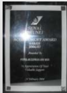
Royal Brunei Airlines "Achievement Award" 2006/2007