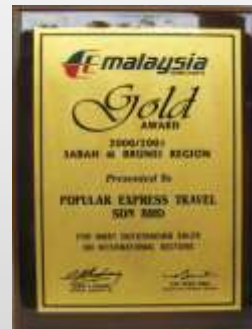
Malaysia Airlines "Gold Award" 2000 / 2001