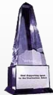
Sabah Tourism Board "Best Sabah Tour Operator" 1999/2000