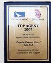
Dragon Air & Cathay Pacific "Top Agent" 2007