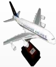
Silk Air "Top Agent" 2008/2009