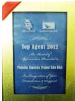
Dragon Air & Cathay Pacific "Top Agent" 2012